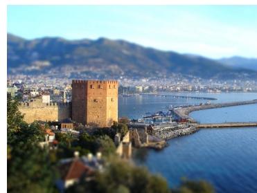
The Red Tower at Alanya

Alanya is a modern beach resort in Turkey and an ancient Seljuk city. Its prominent feature is its mighty rock which juts out Gibraltar like into the Mediterranean Sea. Atop the rock is a red brick crenulated fortress and on either side—magnificent sandy beaches. In 44 B.C. Roman General Mark Anthony gave this entire region to his beloved Cleopatra, and in the 13th Century it was captured by Sultan Aladdin who established his summer capital there.