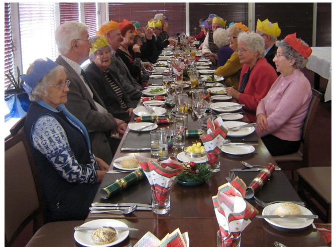
Xmas Lunch for the History Group at Aylesbury College