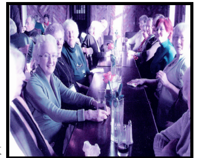
The Out and About Group— on this occasion all ladies— enjoy their meal at Aylesbury Golf Club

This Group had its first meeting of 2010 at the end of January when 18 people turned up—the highest number since the group began almost a year ago. We had some lively discussions on various outings which members would like to participate in during the coming year. These included walks through snowdrop parks, visiting Windsor Castle and St. George's Chapel; a visit to the 'Art, Design and a Taste of Summer' event being held over the May Bank Holiday, and a number of others. Following the meeting 14 of those attending enjoyed a meal at the Aylesbury Golf Club— and voted it enjoyable and extremely good value for money. Following on from this one of those present volunteered to arrange a monthly lunch to experience different national cuisines.