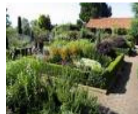
RHS Hyde Hall

Tuesday 25th May: The annual plant sale when members and others can bring 'spares' from their own gardens. A charge of £1 will be made and refreshments will be provided.