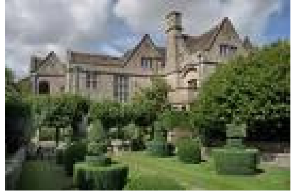
Rodmarton Manor—see our April Outings in the Diary