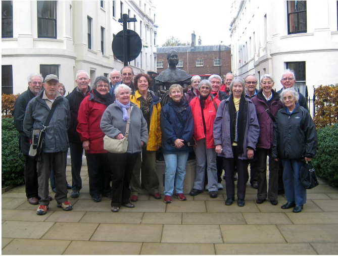
A London Walks Group at Victoria Square