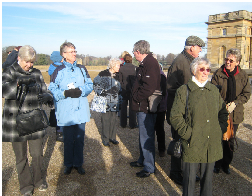
All dressed for the cold on the visit to Blenheim Palace