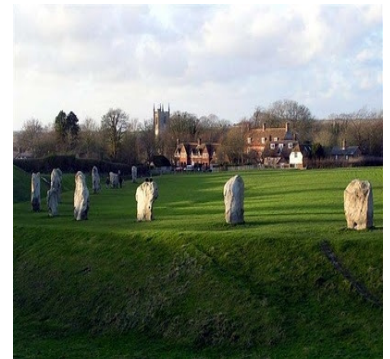
Avebury Stone Circle

Everyone should be prepared with suitable clothing and walking shoes and a change of shoes in a polythene bag to avoid getting dirt in the coach.