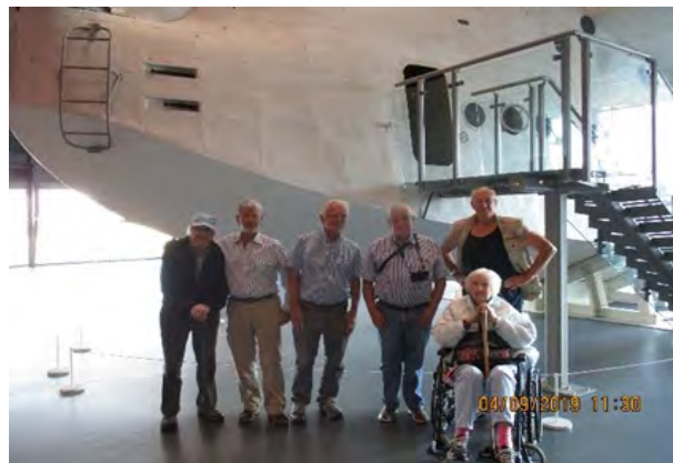
Members in front of a Sunderland flying boat at Hendon