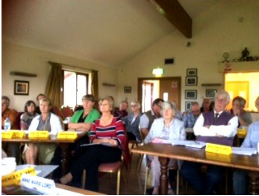
Concentration at a T.V.N. meeting!

Many of you will be used to me talking about the Thames Valley Network and the Study