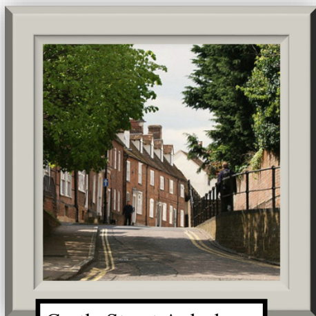
Castle Street Aylesbury