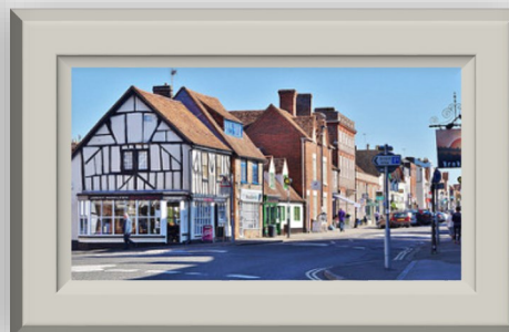
Taken in Thame