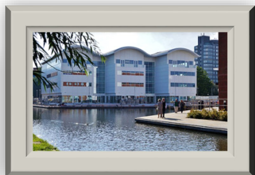
An unusual view of Aylesbury's latest University Campus building

This is just a small selection of photographs—you could spend many happy hours investigating the others!