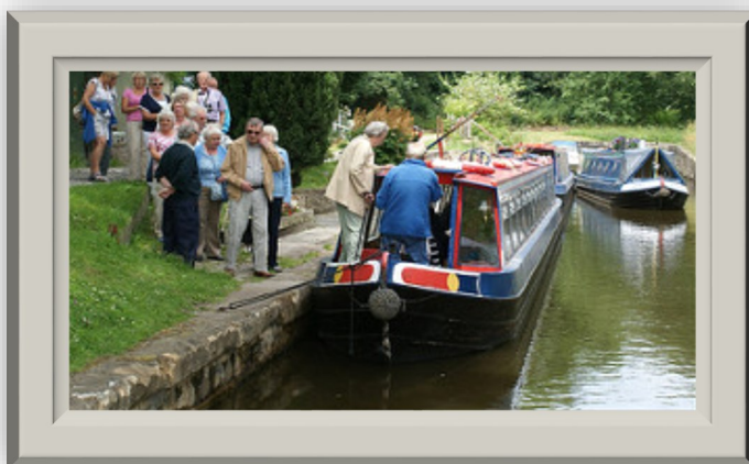
Members boarding the Eirly (snowdrop to you) on the Llangollen canal on a Welsh Study Visit