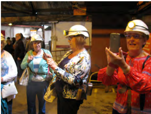
Getting kitted out to go down 'The Big Pit' at Aberafon. By law visitors must wear the same equipment that the miners carried: helmet, cap lamp, belt, battery and self rescuer.