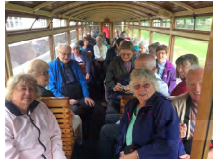
A happy group on the Brecon Mountain Railway— a 1 ft 11 3 / 4 in narrow gauge tour- ist railway on the south side of the Brecon Beacons, photographed by our delightful driver Shaun Cato