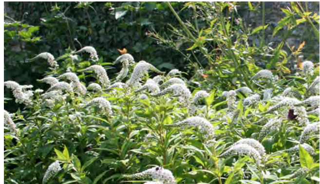
And in the garden at the same venue Tony Poth asks "Can anyone see the gardener?"