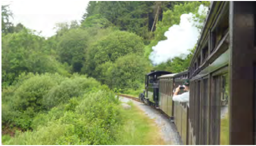
The first time that U3A members can claim to be going around the bend ?