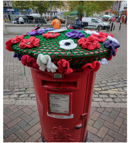
Post Box in Market Square