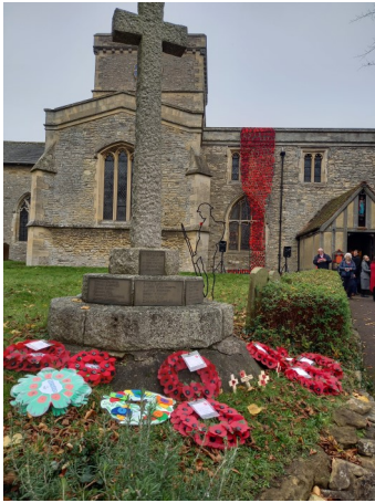
St James' the Great Church in Birtton was beautifully decorated with poppies that were knitted by ladies from the parish and which also adorned trees in the garden.